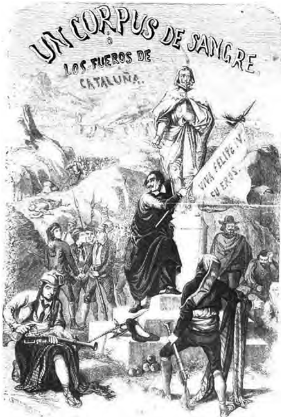
FIGURE 1. First plate in the edition of Un corpus de sangre .